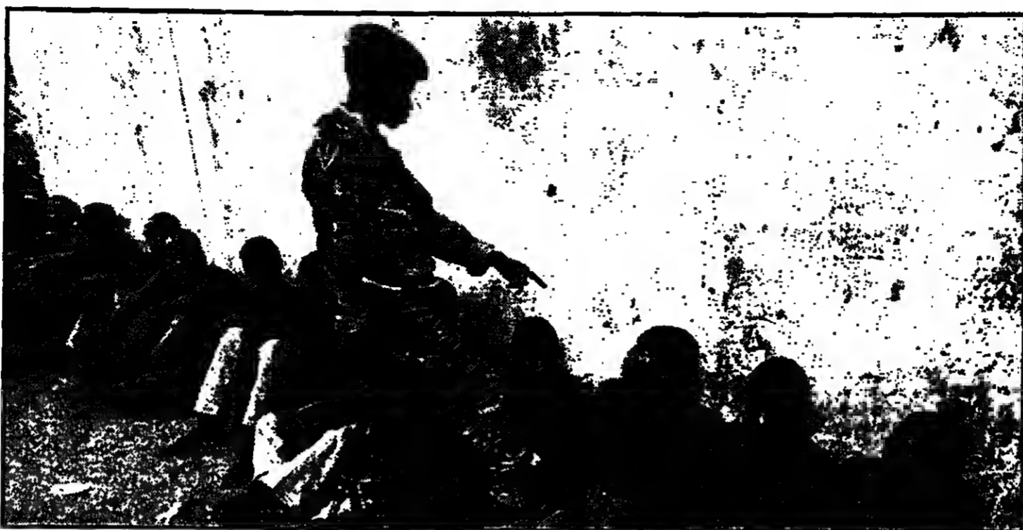
Rwandan men taken out of a hospital in Kinshasa are watched by a rebel soldier yesterday.

The television report, citing the "Mobutu encourage," said Mobutu had been awake by gunfire late Saturday night and determined